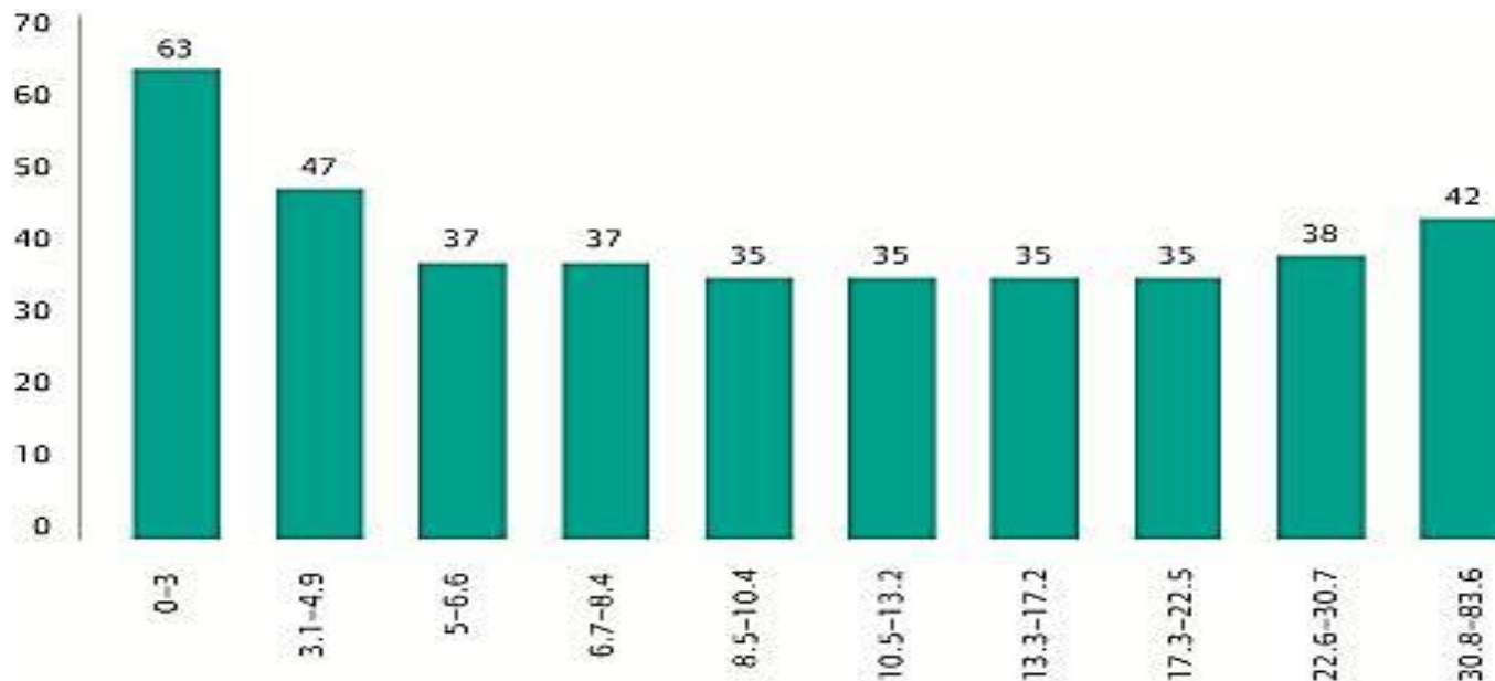
Percentage of Key Stage 4 cohort eligible for FSM

Data based on 2012 Key Stage 4 validated data. Figures represent all open secondary schools that have had a published section 5 inspection as at 31 December 2012. Schools with percentage figures exactly on the decile boundary have been included in the lower decile.