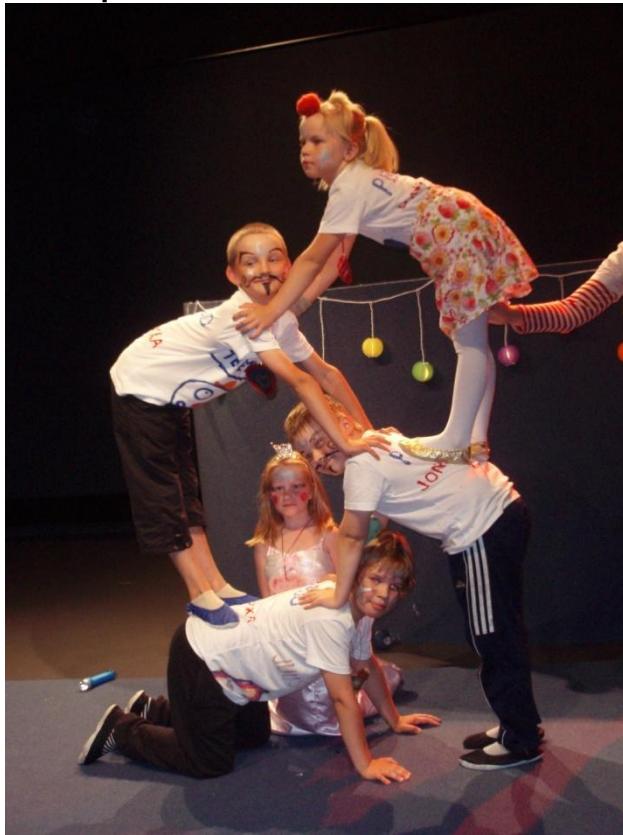
Circus workshop at Pii Poo, Lempäälä