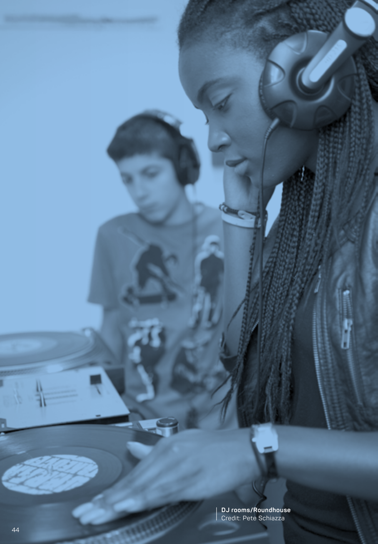
DJ rooms/Roundhouse