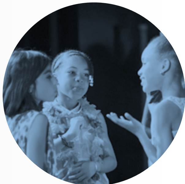
Strong Voices/Haringey Shed

In schools, particularly schools already struggling to support young people to achieve well in ‘the basics’ of literacy and maths, cultural education can sometimes be seen as a ‘nice-to-have’ add-on to the existing curriculum. School leaders perceive a risk that precious time and resources could be wasted delivering activities which hold little value. In fact, there is an even greater risk – that a poor experience during childhood can put a child off future similar cultural activities in adulthood.