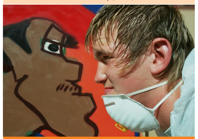
Unitas Summer Arts College

Isambard School receive the highest number of Year 7 students on the Risk Of NEET Indicators (RONI) list in their local authority, yet have one of the highest success rates in securing positive destinations for their students. They use Arts Award within the curriculum with many of these students as a tool for engagement, motivation and achievement. It is also offered as a voluntary enrichment activity and as an option offered by the Special Educational Needs and Disability (SEND) team.